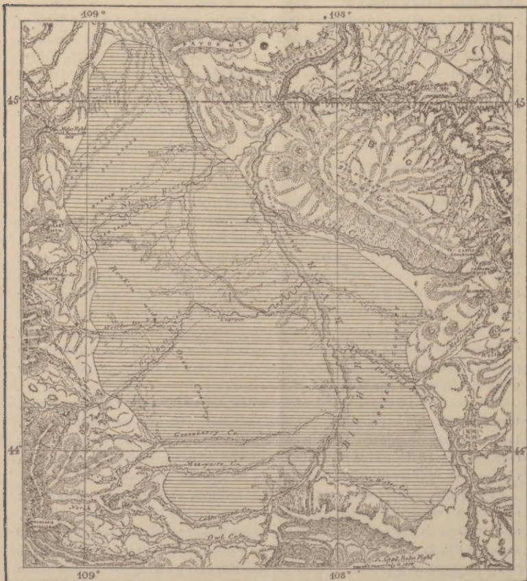
Map of the Big-Horn Basin, reduced from the Map of the U. S. War Department.